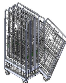
4 folded Roll In 1 ROLL