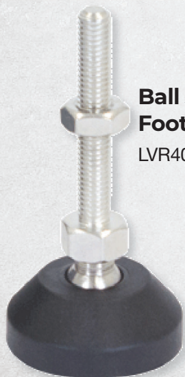
Ball Jointed Foot LVR400850S

For stainless steel option add SS to the part number, eg. LVR400850SSS