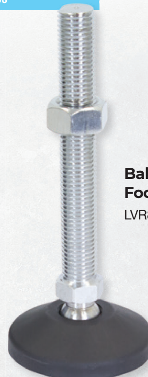
Ball Jointed Foot LVR8020150S