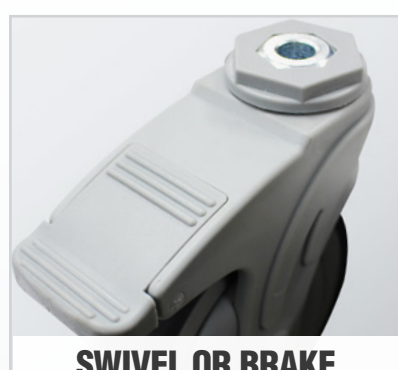
SWIVEL OR BRAKE VARIETIES AVAILABLE

Richmond's Plastech range of castors are perfect for use on food service trolleys, utility trolleys, hospital & medical equipment, and more.