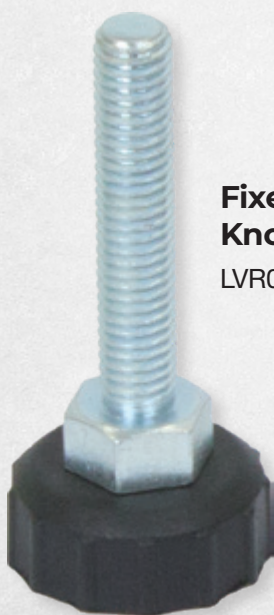
Fixed Nylon Knob Foot LVR057