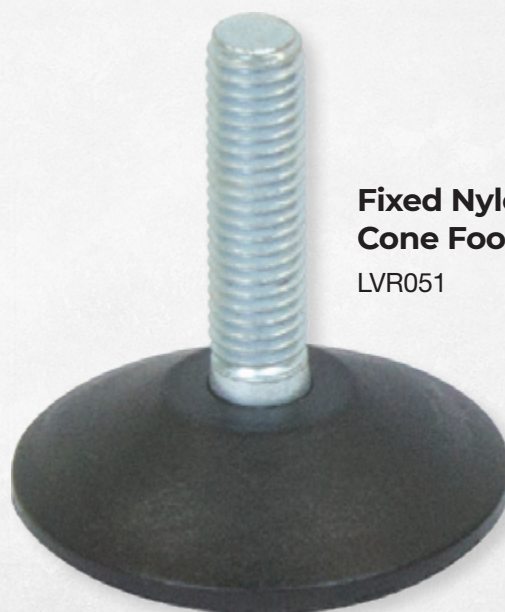
Fixed Nylon Cone Foot LVR051