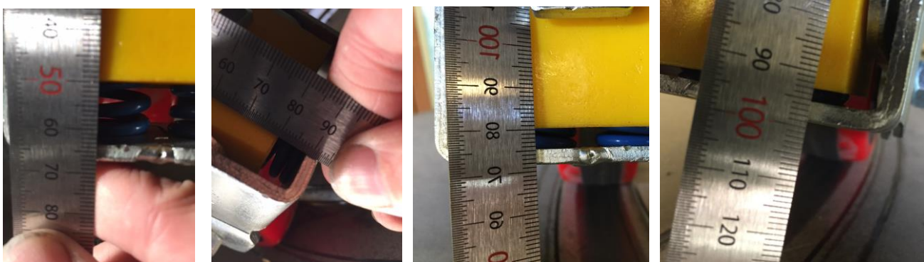
No load 14mm

Note: Same castor & wheel used each time.